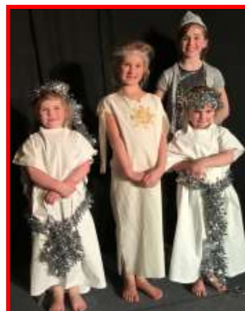
The Angels and the very bright Star