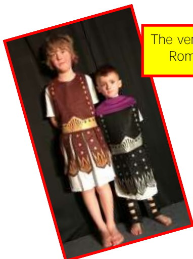
The very busy Romans