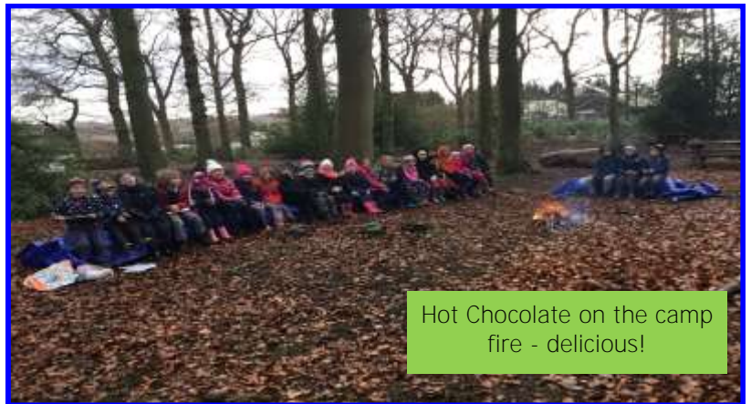
Hot Chocolate on the camp fire - delicious!

We wish everyone a Happy Christmas and a Happy and Healthy 2018 School re-opens on Tuesday 9th January 2018