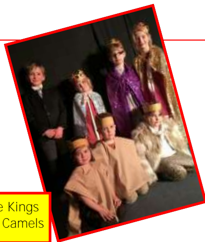
The Kings and Camels

What a busy Autumn term! We started the term with our topic 'Can you dig it?' which involved the children becoming geonauts and archaeologists, making discoveries about dinosaurs and life before humans. This topic also involved us investigating fossils and learning about the past from them. This current half term we have been studying the 'Rotten Romans' and have found out many disgusting habits that they had. We have also looked at Roman soldiers and the Roman army investigating their invasions and how they were eventually defeated. As Christmas approaches we turned our attention to the Christmas performance. All children have tried hard to learn their lines including the song words.