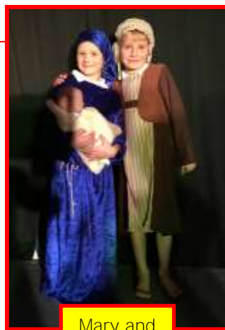
Mary and Joseph