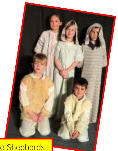
The Shepherds and their Sheep